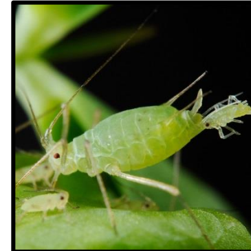
Small insects (less than 3mm)